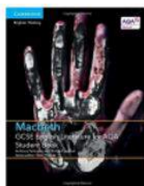
GCSE English Literature for AQA Macbeth student book