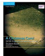
GCSE English Literature for AQA A Christmas Carol