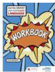
Get the Grade! AQA GCSE English Language Workbook